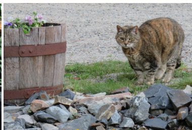
PT stalking Chippie