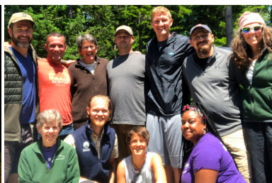
Silence & Heart, June 2020