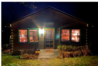
The cabin alive!

O Human Spirit! What Ode will we write to you today? To which task will we devote two years? What heartfelt conversations will we have with each other? How will we prepare the ground to be Holy again? All this, and more we hold in the fullness of Silence.