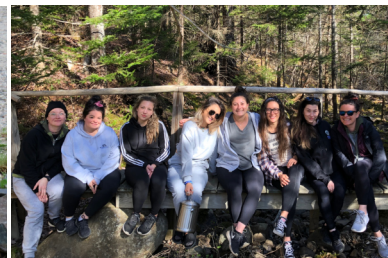
On the Bridge, Spring 2021